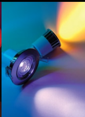
Emblazon Lights® Series Downlight