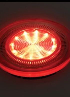
Emblazon Lights® Series Colour Ring

Information about other Coolon LED Lighting products is available at http://www.coolon.com.au