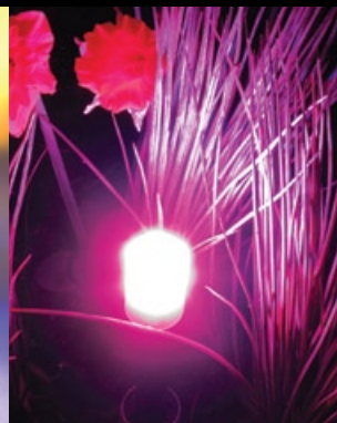
Emblazon Lights® Series Garden Light Module