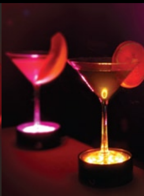
Emblazon Lights® Series Bottle Stand